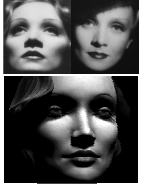
Figure 4: Original photographs of Marlene Dietrich (above), and her Digital Clone^{TM} at a younger age (below).