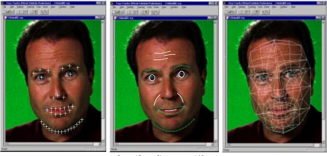
Eye centers & Pupils (4 pts) Mouth corners (2 pts) Nose & Nostrills (3 pts)