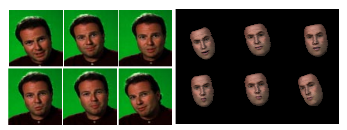
Figure 3: Typical input (left) and rendered output (right) sequence of a talking head used in a TV commercial.